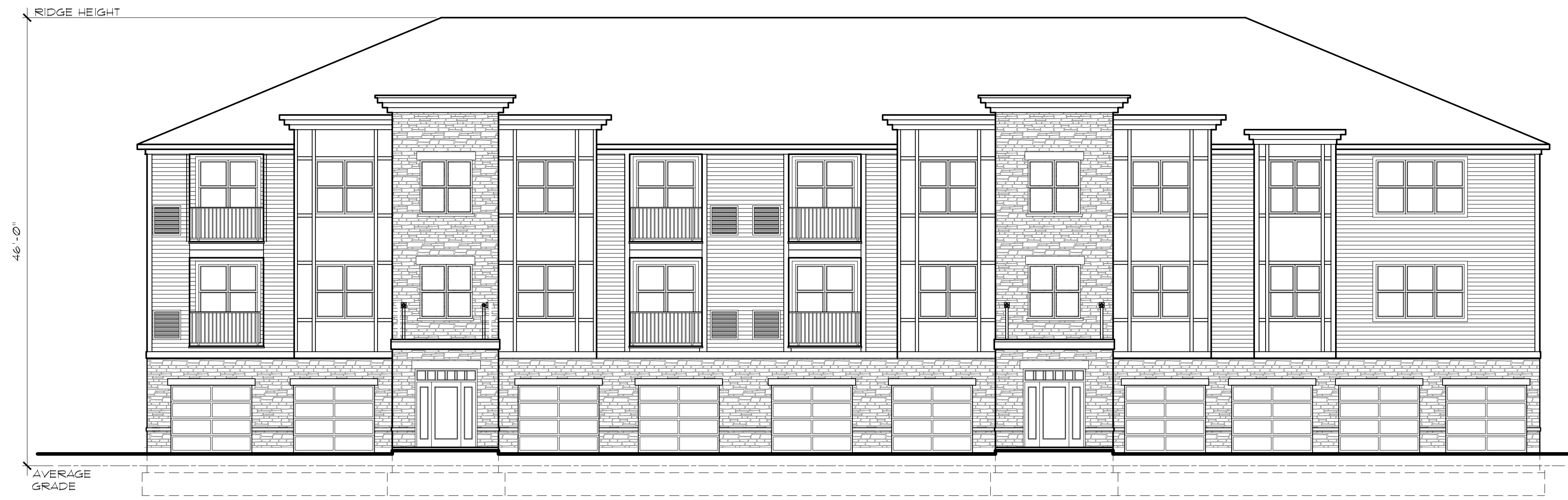
1 FRONT ELEVATION SCALE: 1/8" = 1'-0"

KAPLAN COMPANIES NEW MULTIFAMILY BUILDINGS FOR CAMELOT @ ERNSTON RD. SAYREVILLE, NEW JERSEY