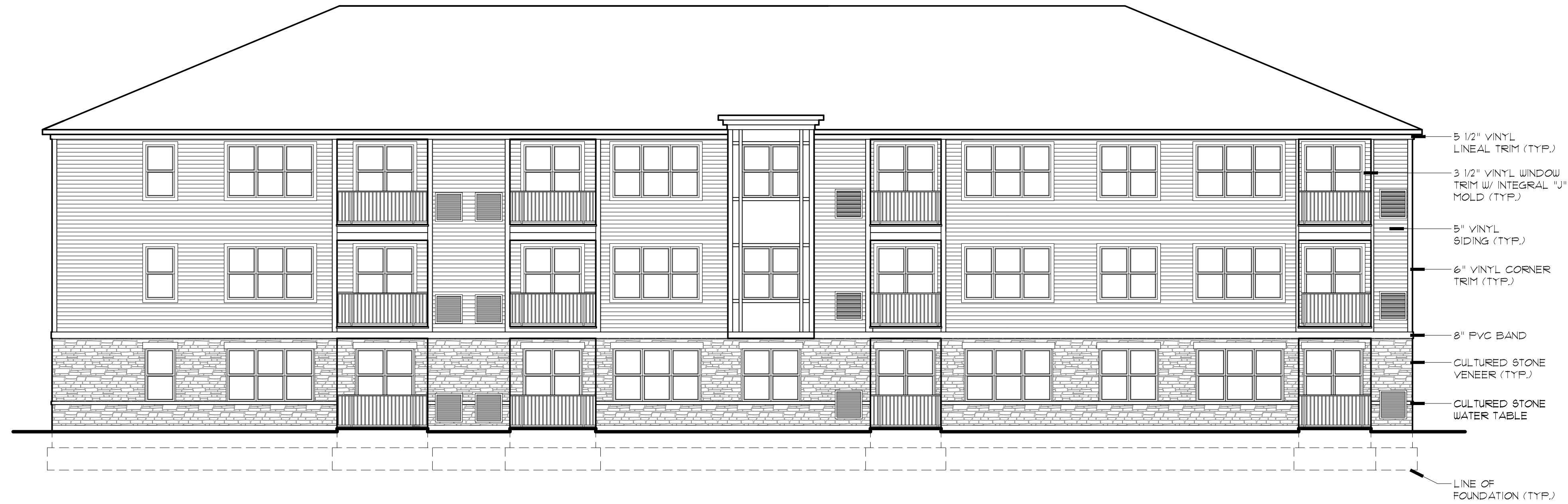
1 REAR ELEVATION SCALE: 1/8" = 1'-0"

KAPLAN COMPANIES NEW MULTIFAMILY BUILDINGS FOR CAMELOT @ ERNSTON RD. SAYREVILLE, NEW JERSEY