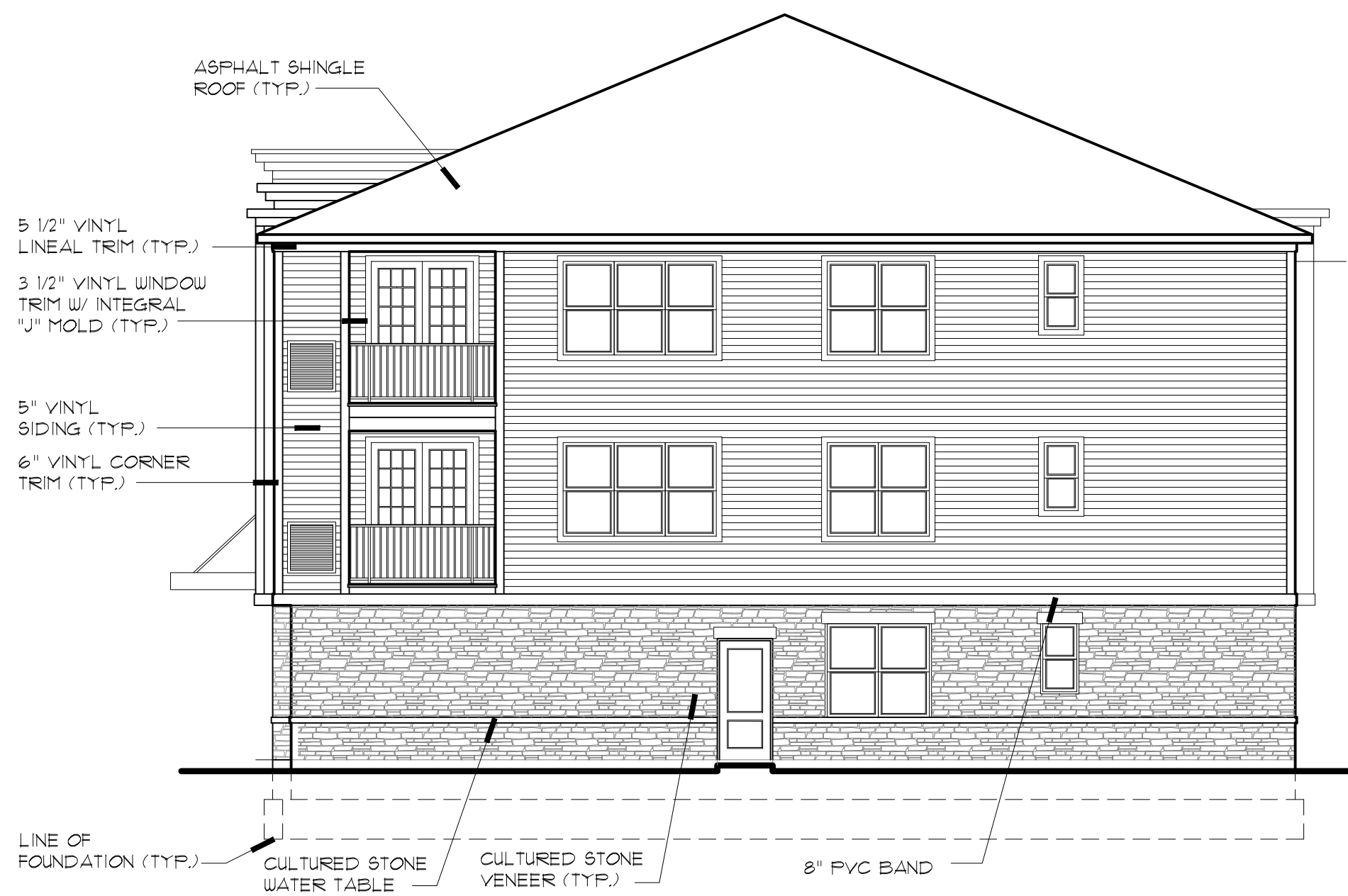
2 RIGHT SIDE ELEVATION SCALE: 1/8" = 1'-0"