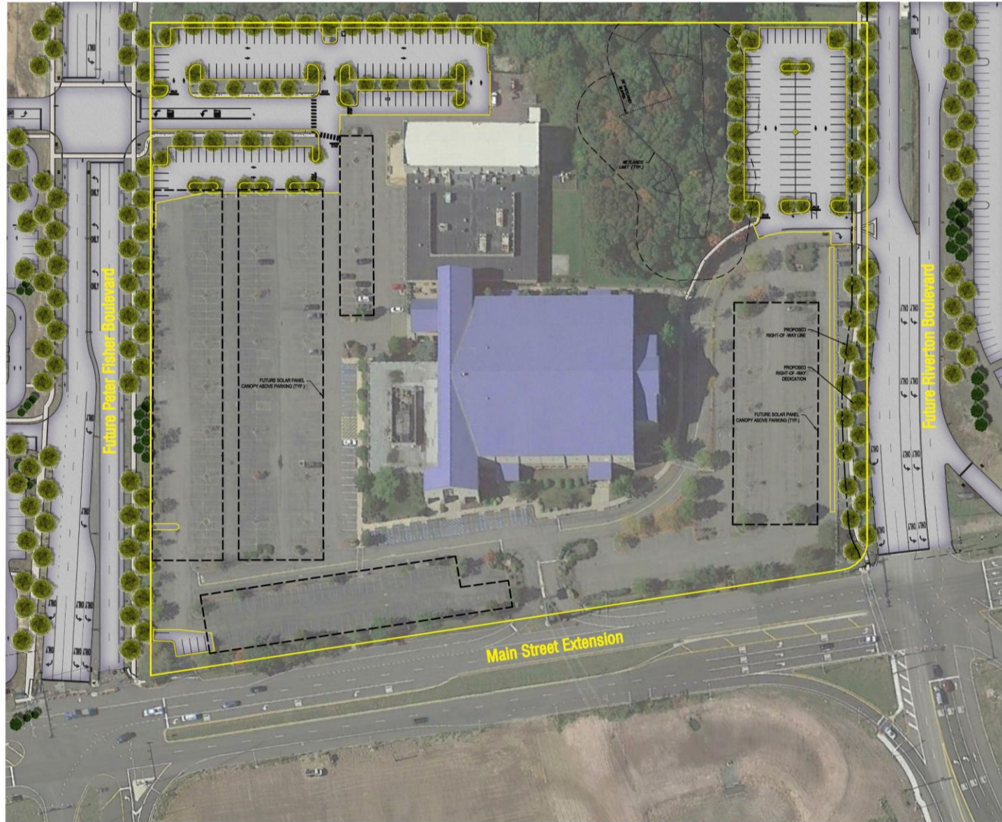
Aerial Imagery shown hereon was taken from Google Earth Pro 2019.