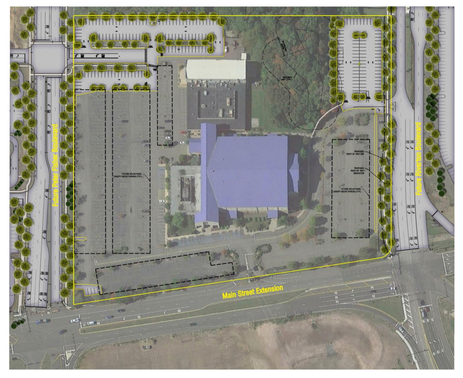
Aerial Imagery shown hereon was taken from Google Earth Pro 2019.